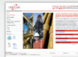
Nexu Energy nexuenergy.com.au