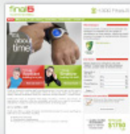
Final5 Recruitment final5.com.au