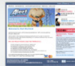
Alert Electrical alertelectrical.com.au