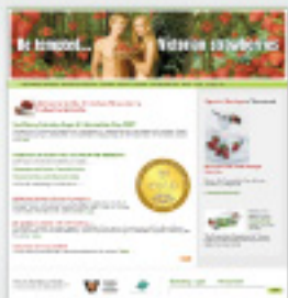
Victorian Strawberry Industry vicstrawberry.com.au